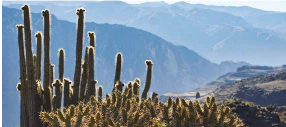
VAST OPEN CANYONS AND ENDLESS HORIZONS