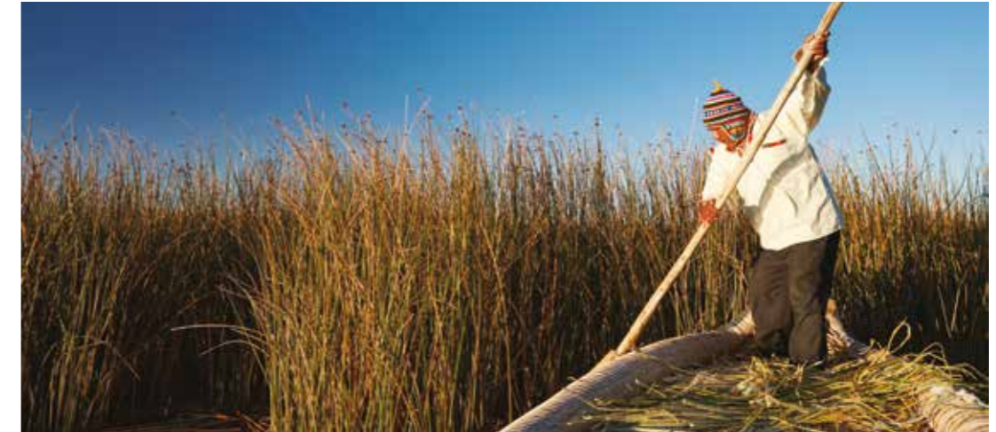
EARLIEST CIVILISATIONS AND RURAL COMMUNITIES